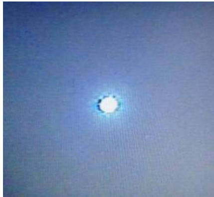
HB series Round Shape at 3m