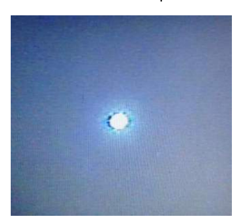
HB series Round Shape at 3m

www.egismos.com tel:+1-360-3893347 sales@egismos.com