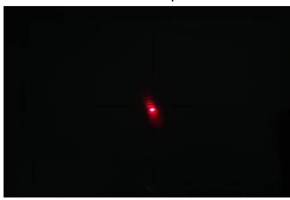
S6 series Round Shape at 3m